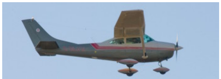
Cessna 182 C-GLVH flies over the target