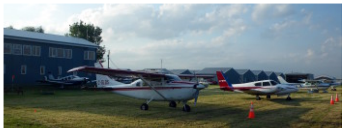
Airplanes parked in front of the Training Centre on Saturday morning. Due to recent rains, some aircraft required a push to get going.

The weekend started with a meet and greet on Friday evening at the Canad Inns Garden City, and a group briefing followed. Crews had time afterwards to prepare charts and logs for their scheduled two flights on Saturday.