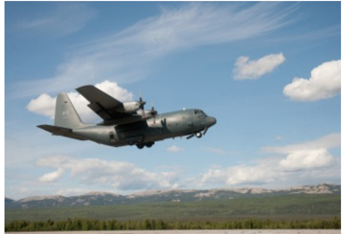
Rescue 342 takes off from Norman Wells.

We retired to the lunchroom to wait for further instructions. Some of the other spotters from Winnipeg joined us, and while we discussed what we had seen, we were told the son of the pilot was coming to see us. He personally thanked each individual, and for the joint effort in the search for his father. He then left to fly to the scene on a Herc.