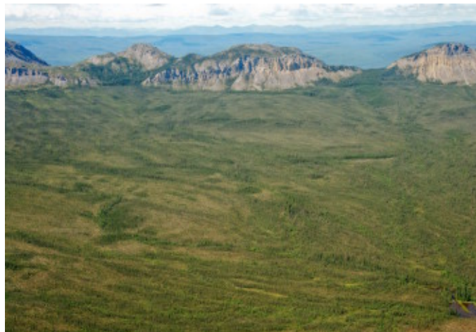
Terrain in the search area.