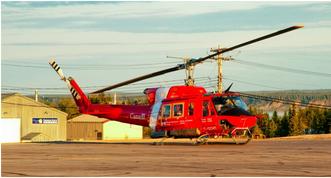
Canadian Coast Guard Bell 212 C-GCHT, which also participated in the search, and made the first report of the crash site.

The Coast Guard pilot had seen a site that looked positive, and we would be the first plane to investigate it. Our SARTechs looked at some photos of the area and decided it was too dangerous to parachute into, so they took some of their equipment and went with the helicopter. We changed planes and put all our kit on Rescue 342.