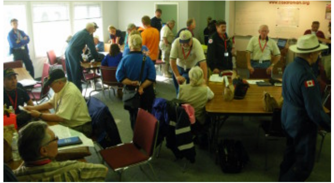
Over one hundred people jammed the Training Centre on Saturday morning as crews prepared for their flights.

Fifty four CASARA Winnipeg members participated at some point during the exercise, as well as over a dozen volunteers from outside CASARA. We hosted over fifty CASARA members from BC, Alberta, Saskatchewan, and Manitoba. Thirteen airplanes participated, including two floatplanes. The planned participation of a Hercules aircraft was unfortunately cancelled due to a major search happening in BC at the same time as the exercise.