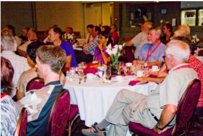
Part of the crowd at the Saturday evening dinner.

Afternoon flights were in the same pattern, with one more airplane sent to Lac du Bonnet for the casualty simulation. All aircraft returned on time, and participants had time for a bit of a rest at the hotel before the Saturday group dinner. Crews received their tasks for Sunday before calling it a night.