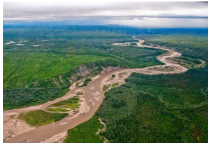
Terrain in the search area.

On Sunday, July 25, we took off at 1944Z to transit to Norman Wells. Because of low ceilings in the area, it was decided to do a high altitude electronic search at 20,000' looking for an ELT signal. We flew from Norman Wells to Peace River and part way back with no hits. We were off search at 0400Z. There was still no fuel at Fort Simpson so we returned to Yellowknife, touching down at 0130Z.