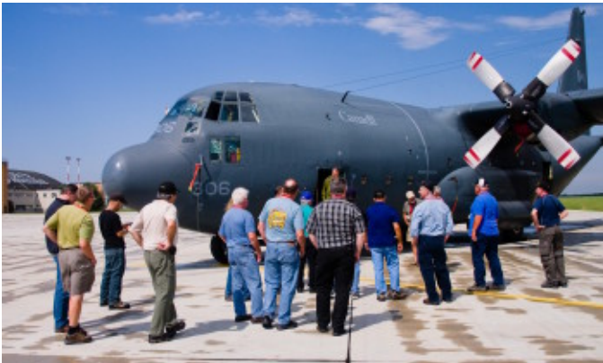
Early arrivals received a tour of the CC-130 Hercules and the 435 Sqn hangar on Friday afternoon.